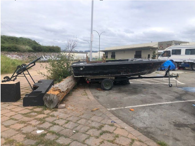
Boat stored in South Parking lot