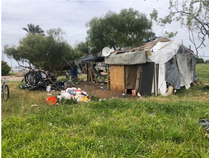
Structure next to playground with dog

Here's what the park looks like today April 23, 2024: