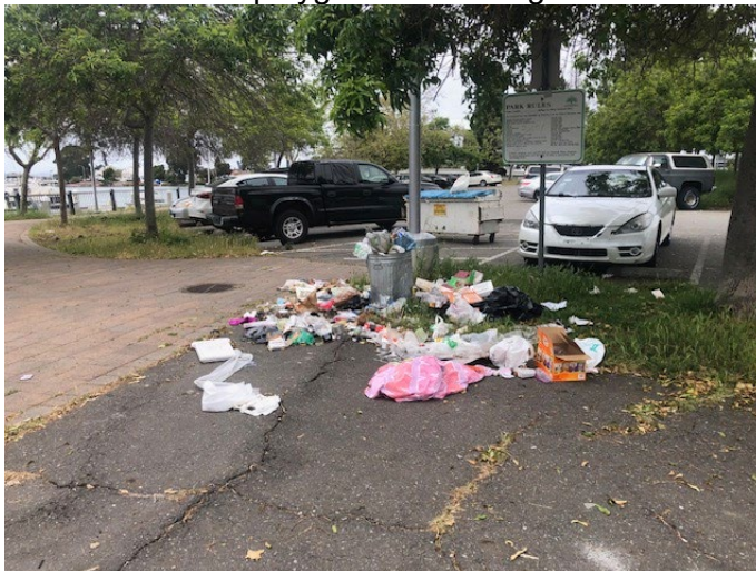
Marina Parking lot