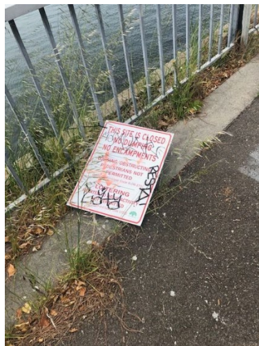
Encampment next to Coast Guard Bridge Sign posted