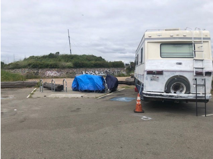
RV parked in South Parking lot over 6 months