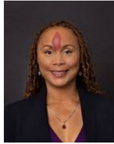
Cecilia Taylor Vice Mayor City of Menlo Park