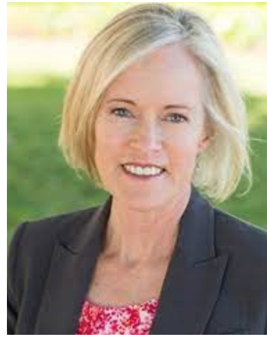
Kate Colin Mayor City of San Rafael