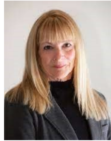
Sandra Lowe Mayor City of Sonoma