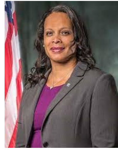
Lisa Gauthier Mayor City of East Palo Alto