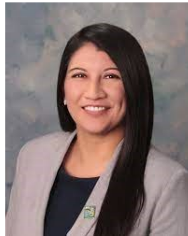
Dorriss Panduro Councilmember City of Fairfield