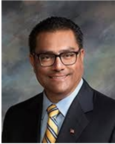
Mark Salinas Mayor City of Hayward