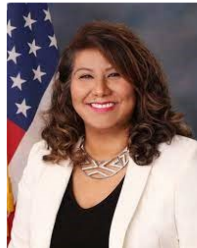
Alma Hernandez Mayor City of Suisun City