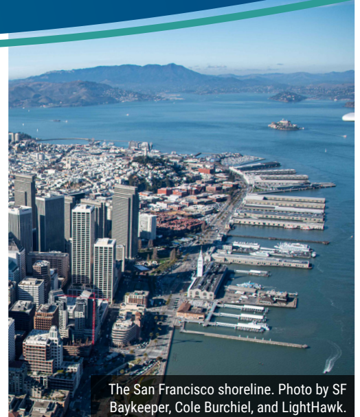
The San Francisco shoreline.