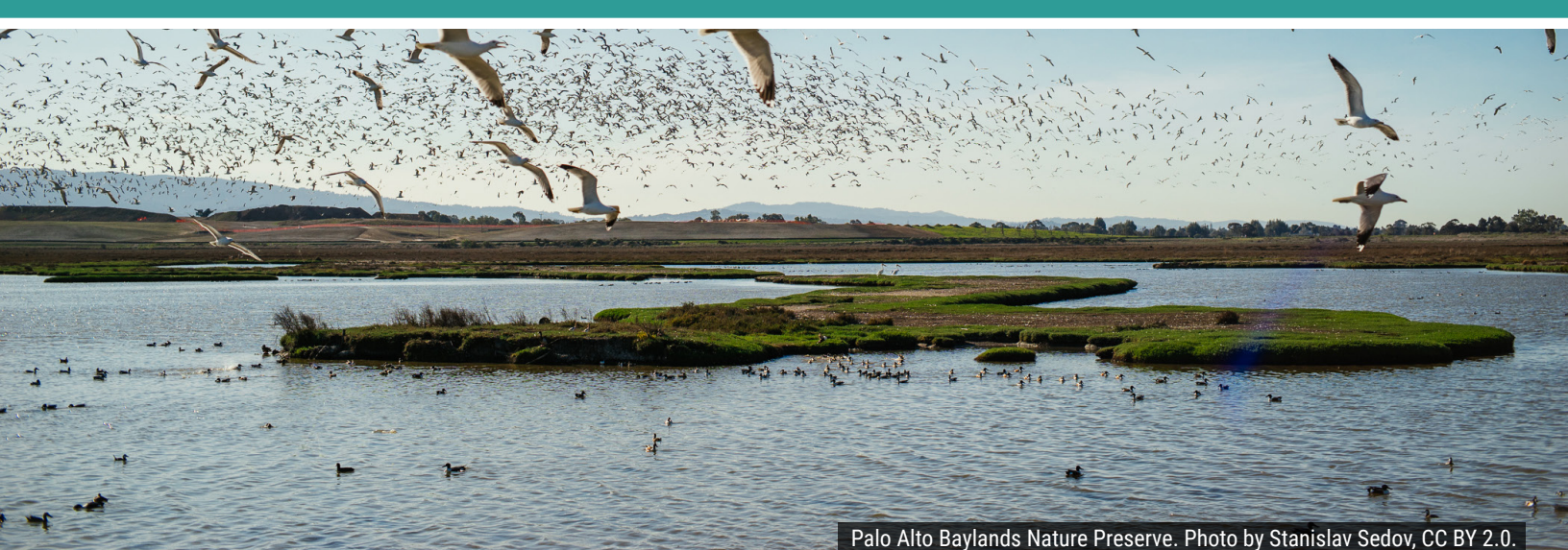
Palo Alto Baylands Nature Preserve.