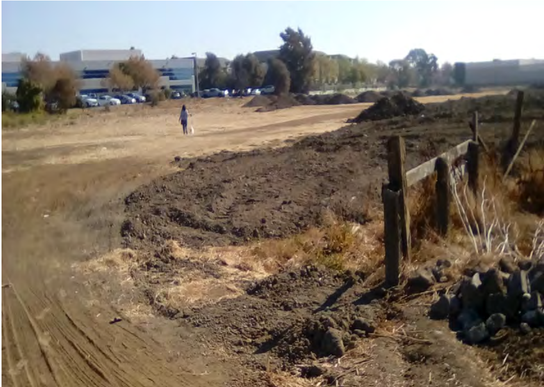
November 8, 2019