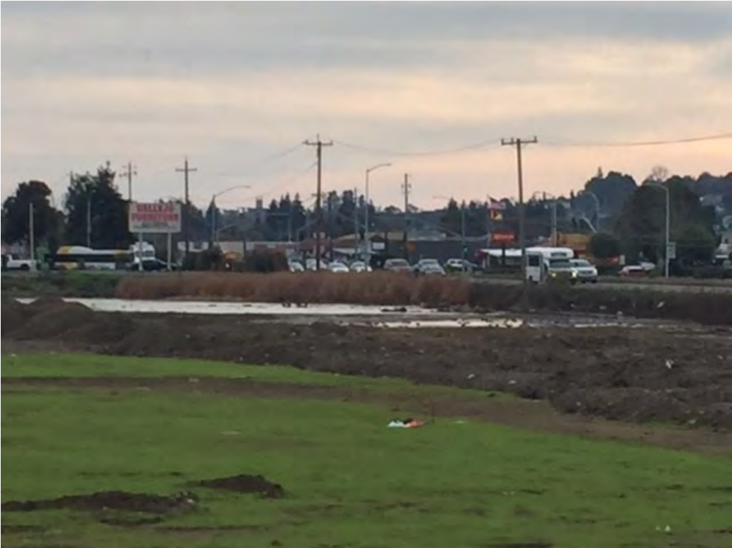
December 17, 2019